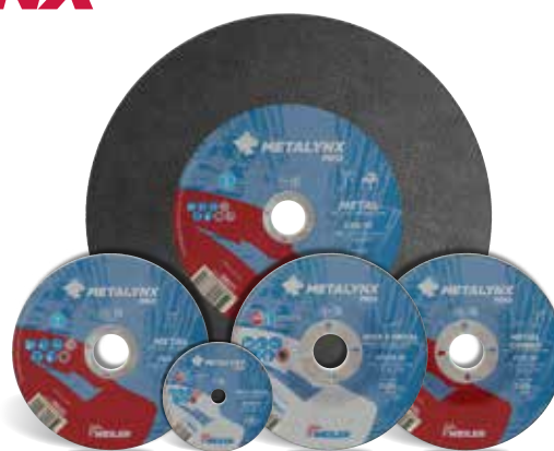
PRO PERFORMANCE LINE