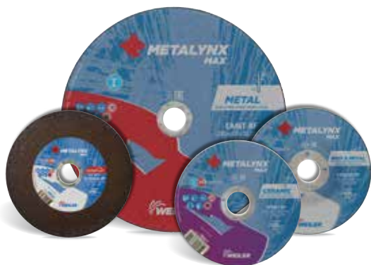
MAX PERFORMANCE LINE