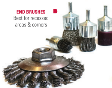
END BRUSHES Best for recessed areas & corners