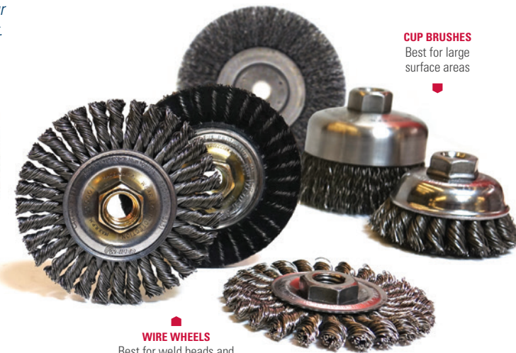
CUP BRUSHES Best for large surface areas